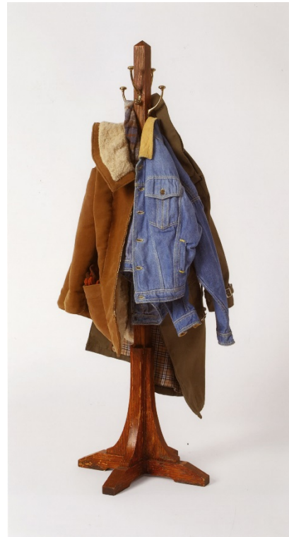
Charles LeDray: Hall Tree , 29 x 14 x 9 1/2 inches, 2006. Private Collection, Houston

The larger room our resale shop is set in is fairly dark. What lighting there is comes from industrial-type hanging fixtures placed over the zones where the clothes are. The fixtures, which only emit light downward, descend to about four feet from the ground, which means that we viewers often crouch a little to see more fully the illuminated realm on the floor. We bend to marvel at what we would normally not find marvelous, and we are particularly aware of how big we are. LeDray’s piece is a kind of answer to Richard Serra’s overpoweringly monumental torqued ellipse sculptures in steel, which we also tend to experience communally. With Mens Suits , we are the dwarfing ones.