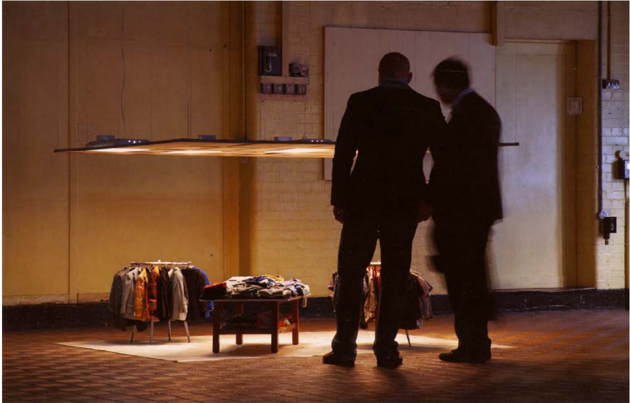
Charles LeDray: Mens Suits (2006–2009), mixed media installation.

SPERONE WESTWATER 257 Bowery New York 10002 T + 1 212 999 7337 F + 1 212 999 7338 www.speronewestwater.com