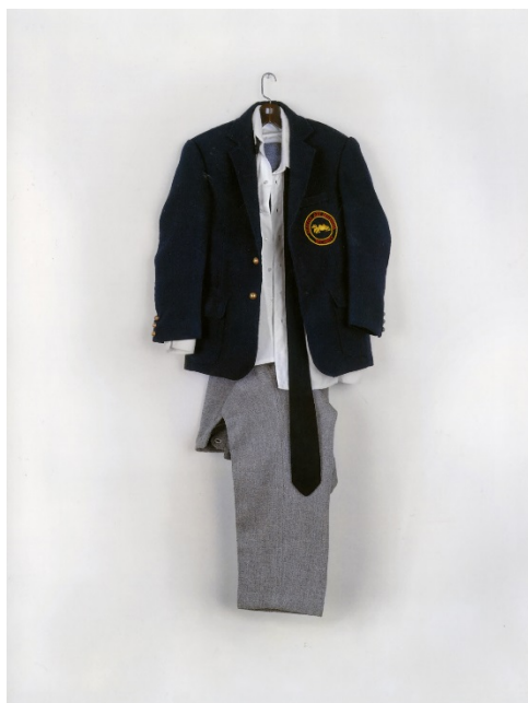
Charles LeDray: S.A.M. , 25 3/4 x 11 x 4 inches, 1994. Collection of Merrill Wright, Seattle

The appealing 1994 S.A.M. (which is not in the show either) is also about a job and might be called a self-portrait of the sculptor. The letters stand for Seattle Art Museum, where LeDray, who is from Seattle, worked as a guard. The roughly two-foot-high piece, facing us on the wall, might be a memory of what LeDray saw in his locker there: gray pants on a hanger, draped over by a white shirt, a dark tie, and a blue blazer with a round patch on the outside pocket reading “Seattle Art Museum Security.”