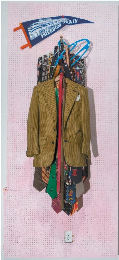
Charles LeDray: Freedom Train , 39 3/4 x 18 x 6 1/2 inches, 2013–2015. The jacket is about twenty inches high. Wadsworth Atheneum Museum of Art, Hartford

For some twenty-five years, Charles LeDray has been surprising and delighting, and sometimes mystifying, the audience for contemporary art. Now fifty-six, LeDray is a kind of realist sculptor whose pieces—in part because his subjects are familiar but not what we would expect in a gallery setting, and in equal measure because he works with such small, essentially miniaturist sizes—have the power of making almost every object he handles seem new to our eyes.